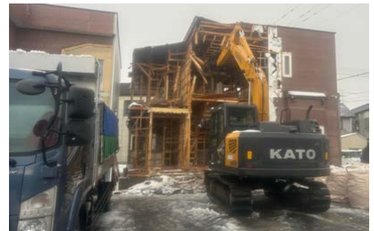
Start of tear-down