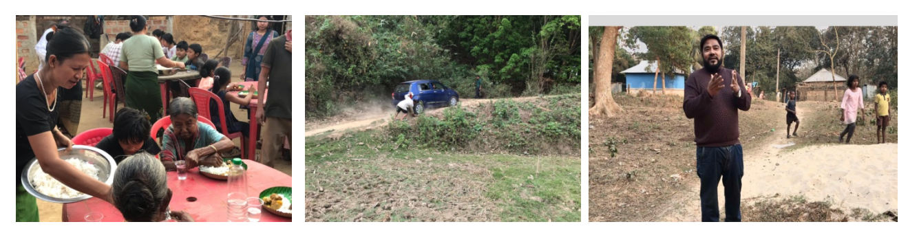
New village new Christian school.