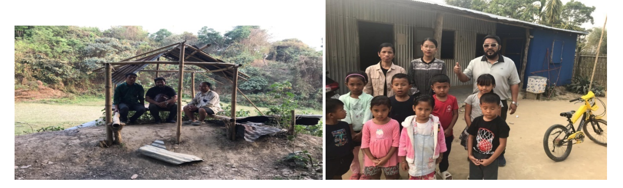
New Villages souls winning.