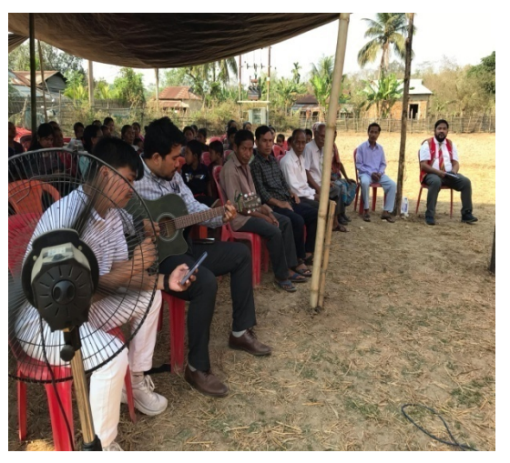
Preaching to new HinduVilleage